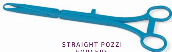
STRAIGHT POZZI FORCEPS